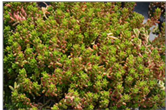
Jelly Bean Plant