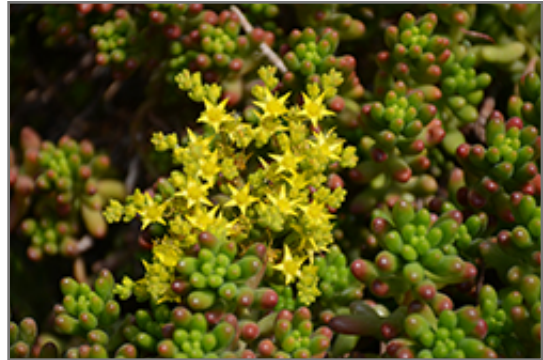
Jelly Bean Plant flowers

Jelly Bean Plant will grow to be only 5 inches tall at maturity, with a spread of 14 inches. When grown in masses or used as a bedding plant, individual plants should be spaced approximately 10 inches apart. Its foliage tends to remain low and dense right to the ground. It grows at a medium rate, and under ideal conditions can be expected to live for approximately 10 years. As an evergreen perennial, this plant will typically keep its form and foliage year-round.