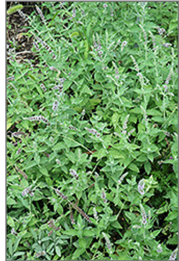
Pennyroyal in bloom