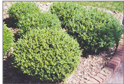
Japanese Boxwood