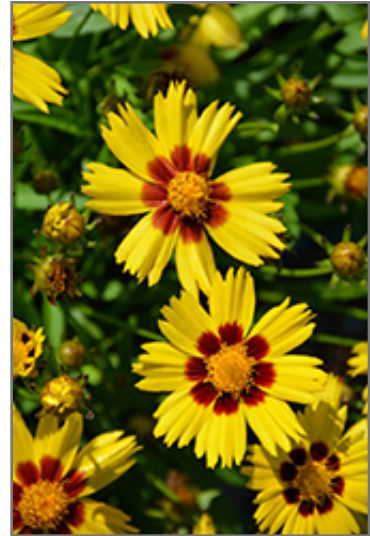
Sunkiss Tickseed flowers