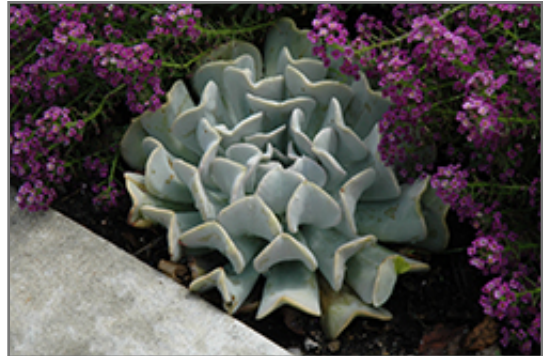
Topsy Turvy Echeveria