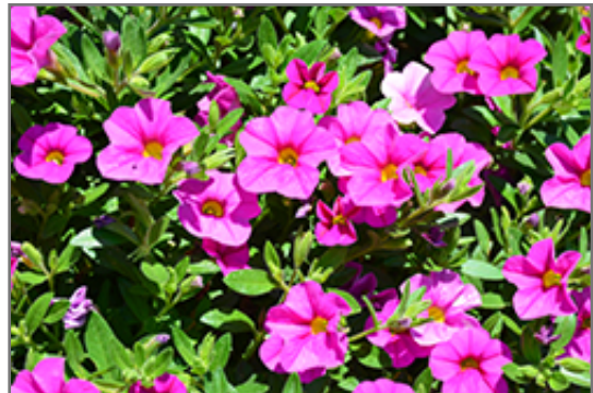
Aloha Nani Pink Calibrachoa flowers

Aloha Nani Pink Calibrachoa is recommended for the following landscape applications;