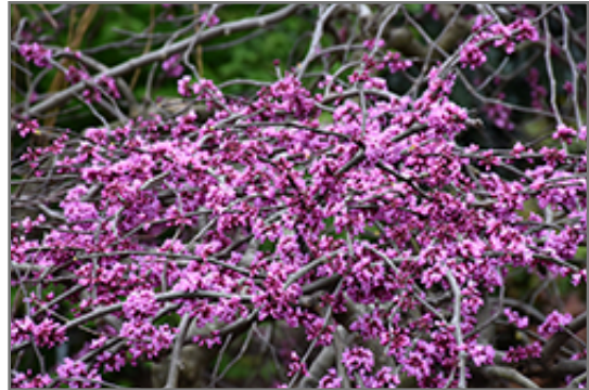
Traveller Weeping Redbud flowers