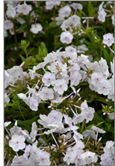
Fashionably Early Crystal Garden Phlox flowers