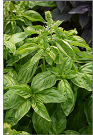
Genovese Basil foliage

Genovese Basil will grow to be about 20 inches tall at maturity, with a spread of 14 inches. When grown in masses or used as a bedding plant, individual plants should be spaced approximately 12 inches apart. This fast-growing annual will normally live for one full growing season, needing replacement the following year.