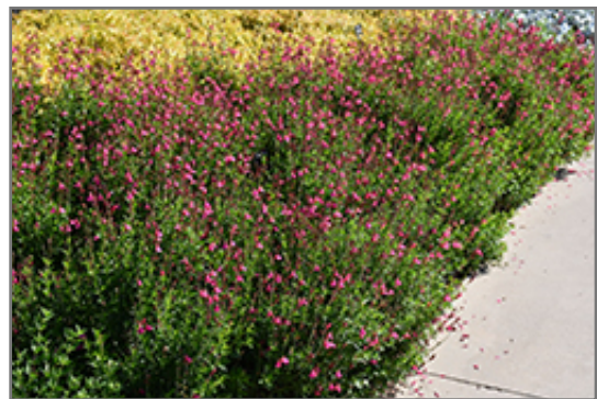
Pink Autumn Sage in bloom