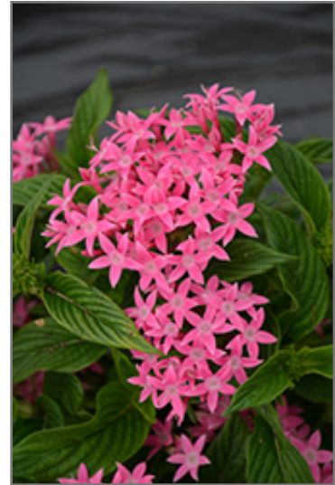
Lucky Star Pink Star Flower flowers

Lucky Star Pink Star Flower is recommended for the following landscape applications;