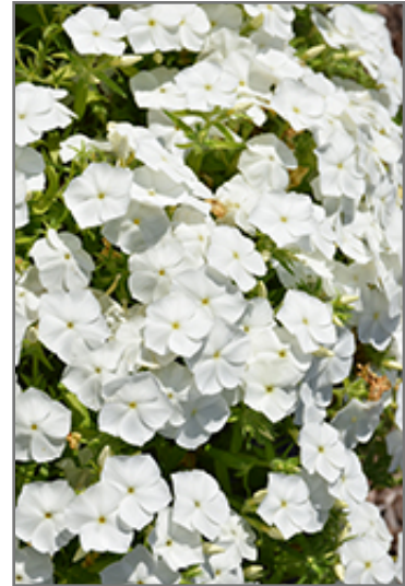
Gisele White Phlox flowers

Gisele White Phlox is recommended for the following landscape applications;