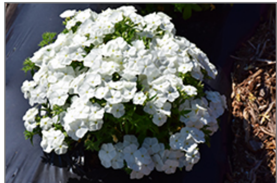
Gisele White Phlox in bloom