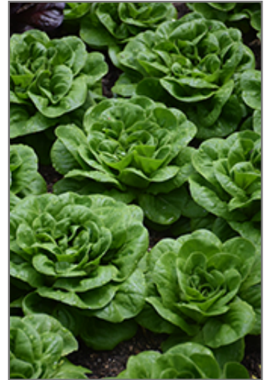
Buttercrunch Lettuce

Buttercrunch Lettuce will grow to be about 12 inches tall at maturity, with a spread of 6 inches. When planted in rows, individual plants should be spaced approximately 8 inches apart. This vegetable plant is an annual, which means that it will grow for one season in your garden and then die after producing a crop. Because of its relatively short time to maturity, it lends itself to a series of successive plantings each staggered by a week or two; this will prolong the effective harvest period.