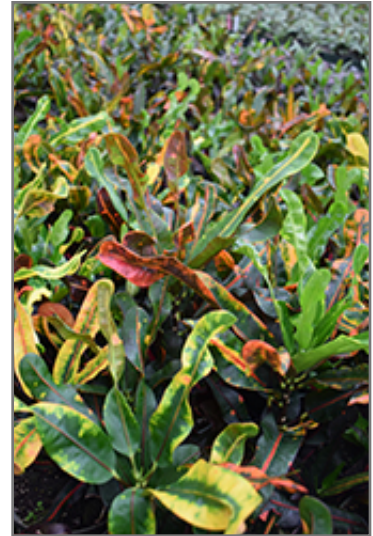
Mammy Croton in full

This is a dense herbaceous evergreen houseplant with an upright spreading habit of growth. Its wonderfully bold, coarse texture is quite ornamental and should be used to full effect. This plant should not require much pruning, except when necessary to keep it looking its best.