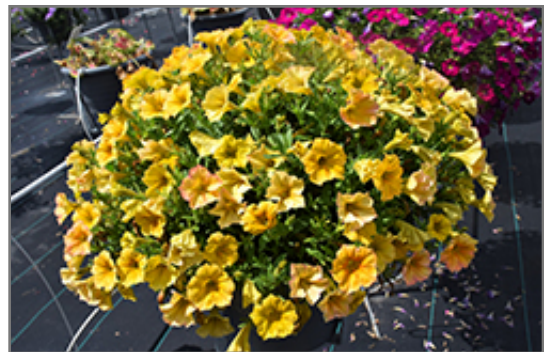
SuperCal Premium Yellow Sun Petchoa in bloom