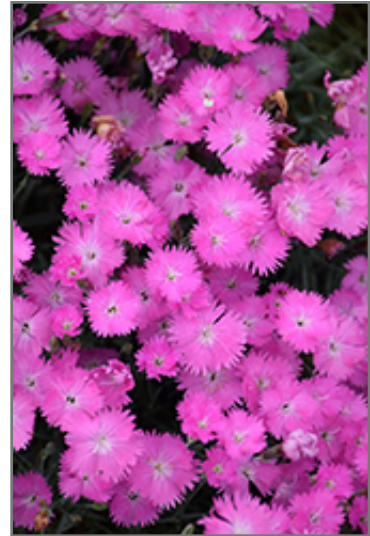
Firewitch Pinks flowers

Firewitch Pinks is recommended for the following landscape applications;