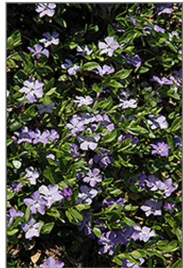
Common Periwinkle in bloom