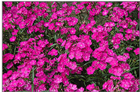
Bouquet Purple Pinks in bloom