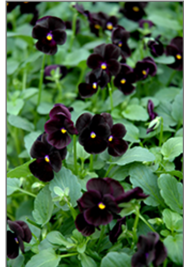
Sorbet Black Delight Pansy flowers