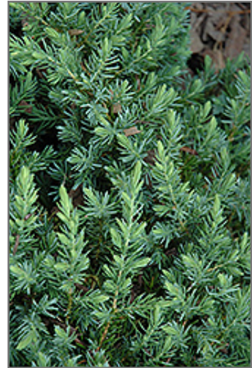
Blue Pacific Shore Juniper foliage