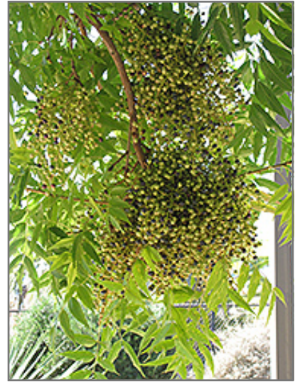
Chinese Pistache fruit

This tree should only be grown in full sunlight. It is very adaptable to both dry and moist growing conditions, but will not tolerate any standing water. It may require supplemental watering during periods of drought or extended heat. It is not particular as to soil type or pH. It is highly tolerant of urban pollution and will even thrive in inner city environments. This species is not originally from North America.