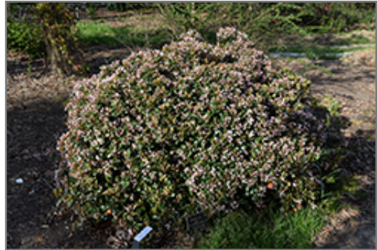
Eleanor Taber Indian Hawthorn in bloom

Eleanor Taber Indian Hawthorn is recommended for the following landscape applications;