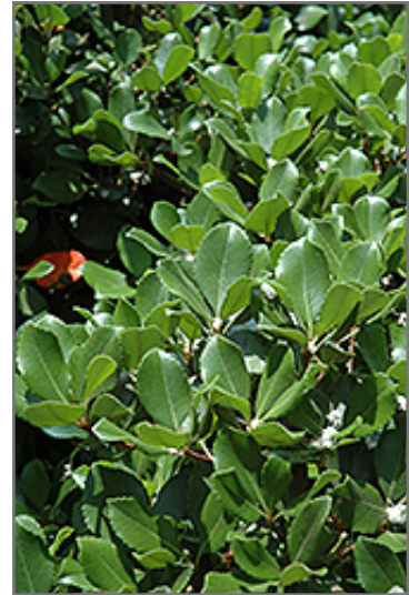
Eleanor Taber Indian Hawthorn foliage

This shrub does best in full sun to partial shade. It prefers to grow in average to moist conditions, and shouldn't be allowed to dry out. It may require supplemental watering during periods of drought or extended heat. It is not particular as to soil type or pH. It is somewhat tolerant of urban pollution. This is a selected variety of a species not originally from North America.