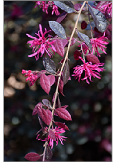
Purple Diamond Fringeflower flowers

Purple Diamond Fringeflower is recommended for the following landscape applications;