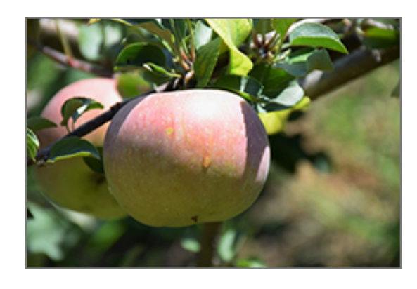
Fuji Apple fruit

Fuji Apple features showy clusters of lightly-scented white flowers along the branches in mid spring, which emerge from distinctive red flower buds. It has forest green deciduous foliage. The pointy leaves turn yellow in fall. The fruits are showy chartreuse apples with a scarlet blush, which are carried in abundance from late summer to mid fall. The fruit can be messy if allowed to drop on the lawn or walkways, and may require occasional clean-up.