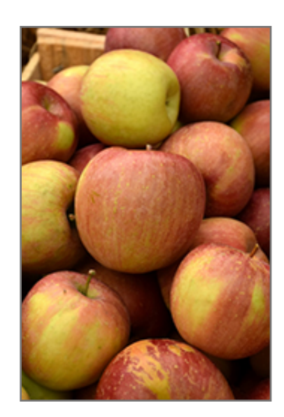
Fuji Apple fruit

Fuji Apple will grow to be about 30 feet tall at maturity, with a spread of 15 feet. It has a low canopy with a typical clearance of 4 feet from the ground, and is suitable for planting under power lines. It grows at a medium rate, and under ideal conditions can be expected to live for 50 years or more. This variety requires a different selection of the same species growing nearby in order to set fruit.