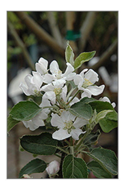
Fuji Apple flowers