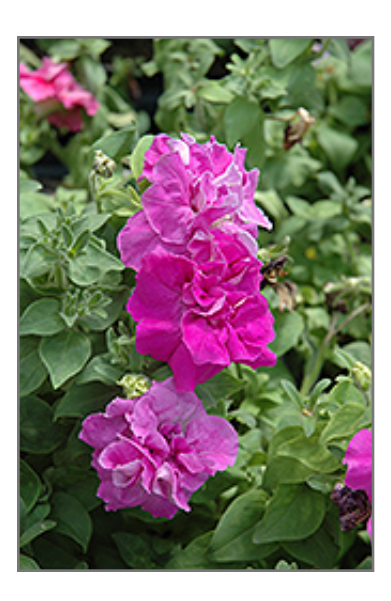
Double Madness Lavender Petunia flowers