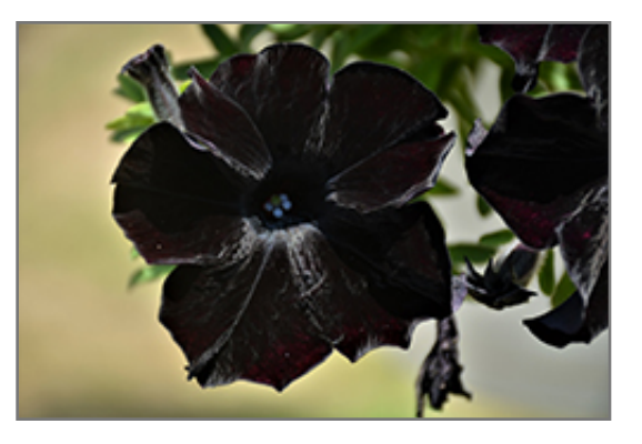
Crazytunia Black Mamba Petunia flowers

Crazytunia Black Mamba Petunia is recommended for the following landscape applications;