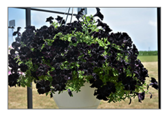
Crazytunia Black Mamba Petunia in bloom