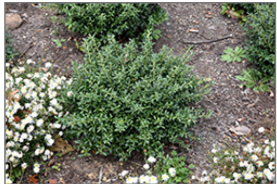
Soft Touch Japanese Holly