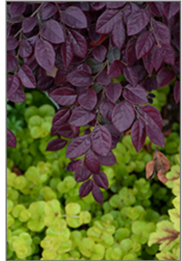
Crimson Fire Chinese Fringeflower foliage

Consider applying a thick mulch around the root zone in winter to protect it in exposed locations or colder microclimates. This is a selected variety of a species not originally from North America.