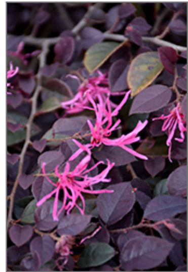
Crimson Fire Chinese Fringeflower flowers

Crimson Fire Chinese Fringeflower is recommended for the following landscape applications;