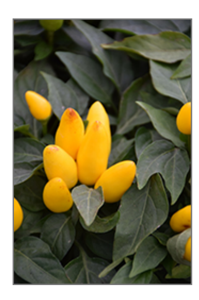
Salsa Yellow Ornamental Pepper fruit

Salsa Yellow Ornamental Pepper is an herbaceous annual with an upright spreading habit of growth. Its medium texture blends into the garden, but can always be balanced by a couple of finer or coarser plants for an effective composition.