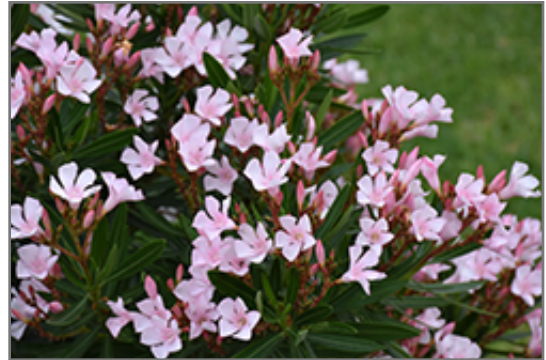
Petite Pink Oleander flowers

Petite Pink Oleander is recommended for the following landscape applications;