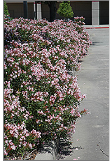
Petite Pink Oleander in bloom

This shrub does best in full sun to partial shade. It is very adaptable to both dry and moist locations, and should do just fine under average home landscape conditions. It is considered to be drought-tolerant, and thus makes an ideal choice for xeriscaping or the moisture-conserving landscape. It is not particular as to soil pH, but grows best in poor soils, and is able to handle environmental salt. It is highly tolerant of urban pollution and will even thrive in inner city environments. This is a selected variety of a species not originally from North America, and parts of it are known to be toxic to humans and animals, so care should be exercised in planting it around children and pets.