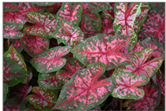
Carolyn Whorton Caladium foliage