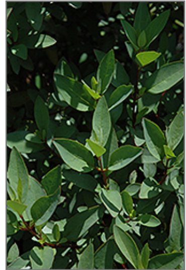
Thryallis foliage

This shrub does best in full sun to partial shade. It is very adaptable to both dry and moist growing conditions, but will not tolerate any standing water. It may require supplemental watering during periods of drought or extended heat. It is not particular as to soil pH, but grows best in sandy soils. It is somewhat tolerant of urban pollution. Consider applying a thick mulch around the root zone in winter to protect it in exposed locations or colder microclimates. This species is not originally from North America.