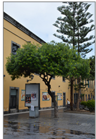
Yellow Oleander in bloom