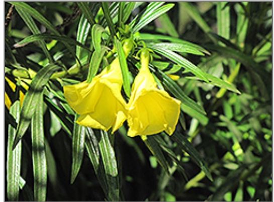
Yellow Oleander flowers