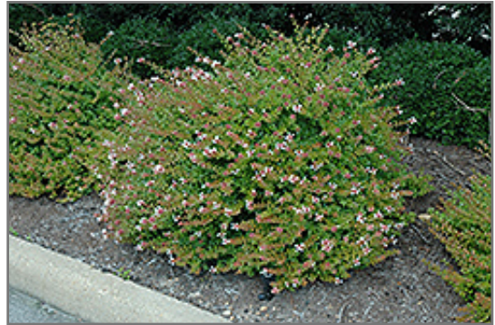
Rose Creek Abelia in bloom

Rose Creek Abelia is recommended for the following landscape applications;