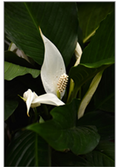
Peace Lily flowers