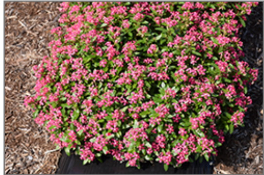
Soiree Kawaii Coral Vinca in bloom

* This is a 'special order' plant - contact store for details