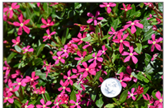
Soiree Kawaii Coral Vinca flowers