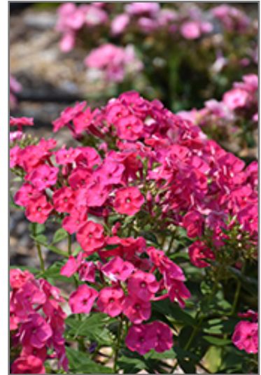
Ka-Pow Pink Garden Phlox flowers

Ka-Pow Pink Garden Phlox is recommended for the following landscape applications;