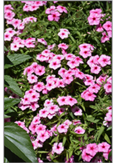
Gisele Pink Phlox flowers

Gisele Pink Phlox is recommended for the following landscape applications;