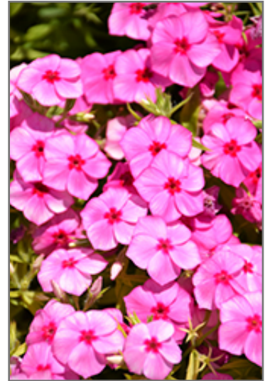
Gisele Pink Phlox flowers

Gisele Pink Phlox is a fine choice for the garden, but it is also a good selection for planting in outdoor containers and hanging baskets. It is often used as a 'filler' in the 'spiller-thriller-filler' container combination, providing a mass of flowers against which the thriller plants stand out. Note that when growing plants in outdoor containers and baskets, they may require more frequent waterings than they would in the yard or garden.