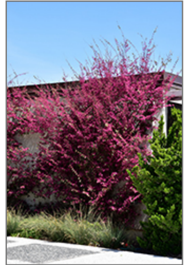
Red-Flowered Chinese Fringeflower in bloom

This shrub does best in full sun to partial shade. It prefers to grow in average to moist conditions, and shouldn't be allowed to dry out. It may require supplemental watering during periods of drought or extended heat. It is particular about its soil conditions, with a strong preference for rich, acidic soils. It is somewhat tolerant of urban pollution. Consider applying a thick mulch around the root zone in winter to protect it in exposed locations or colder microclimates. This is a selected variety of a species not originally from North America.