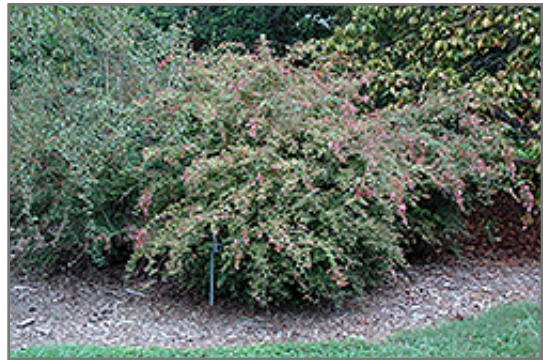
Edward Goucher Abelia in bloom