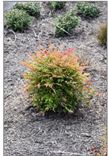
Gulf Stream Dwarf Nandina